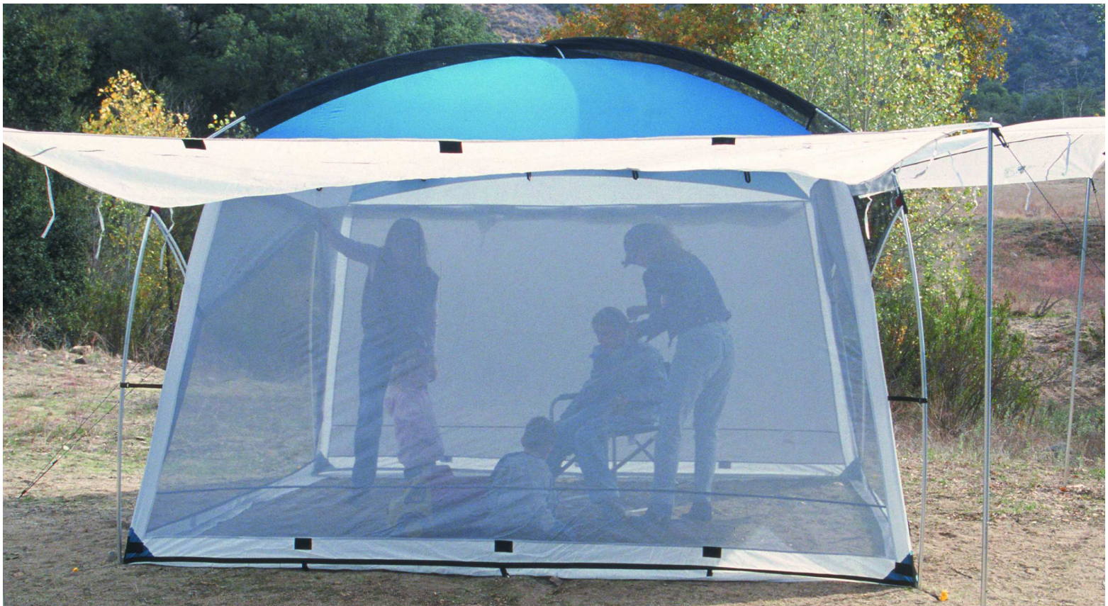
(12'x12' ScreenRoom shown)